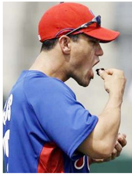
Irrespective of cultures and countries, backgrounds and ethnicities, tobacco is chewed in different forms and

ways. Tobacco use is the single most avoidable cause of death worldwide and is currently responsible for killing one in 10 adults worldwide. In India, at least 800,000 deaths every year are related to tobacco use, out of which 700,000 are related to smoking. Chewing tobacco reduces the lunges to a sponge that soaks in at least 30 known carcinogens, or cancer causing chemicals. The list of tobacco