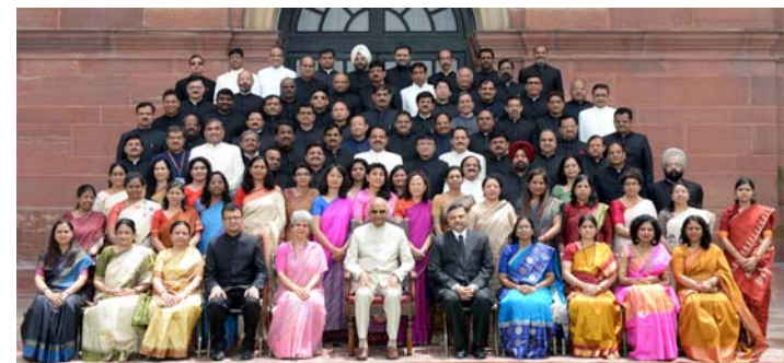
The President, Shri Ram Nath Kovind with the State Civil Service Officers promoted to the IAS and attending the 120th Induction Training Programme at the Lal Bahadur Shastri National Academy of Administration, Mussoorie, at Rashtrapati Bhavan, in New Delhi.

It is a serious hazard to good health. WHO everywhere mark the importance the health risks connected with tobacco use and advocating for effective policies to reduce tobacco use.