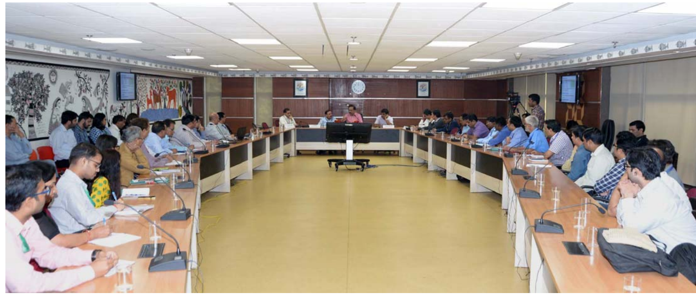
The Union Minister for Science & Technology, Earth Sciences and Environment, Forest & Climate Change, Dr. Harsh Vardhan in a meeting with the members of all the field teams deputed by Central Pollution Control Board (CPCB), in New Delhi on October 27, 2018.

through its PDS outlets. Prices in Delhi would be monitored closely and Delhi government would consider intervening in the market in case prices start hardening. Safal/Mother Dairy was also directed to increase supply of Onion through its retail outlets and larger quantities of Onion would be made available to them from the buffer under PSF. that sown area under the Kharif Onion Crop has increased by 37 percent as compared to 2017 and informed that the supply position of Onions in the market has improved as harvesting has begun in Rajasthan, Sholapur in Maharashtra, Hubli in Karnataka and Kurnool in Andhra Pradesh.