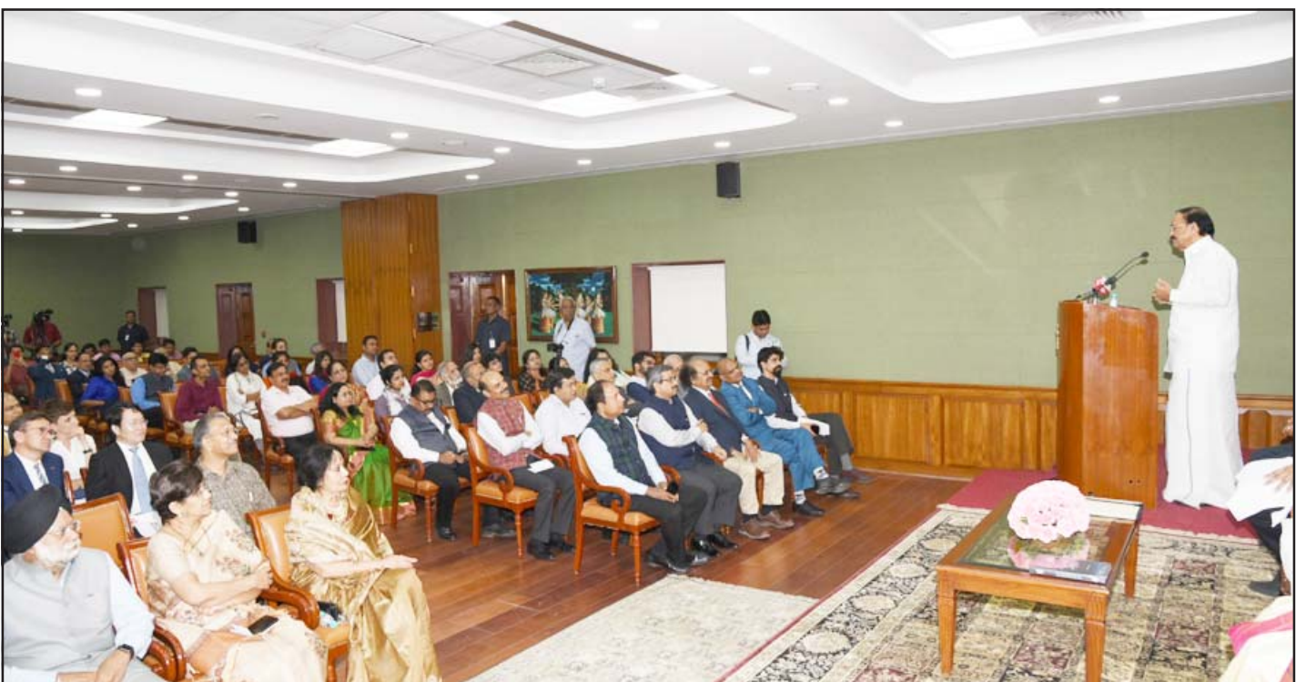
The Vice President, M. Venkaiah Naidu addressing the gathering after releasing the Book 'New-Age Technology and Industrial Revolution 4.0', written by the Member of Parliament, Rajya Sabha, Dr. Narendra Jadhav, in New Delhi.